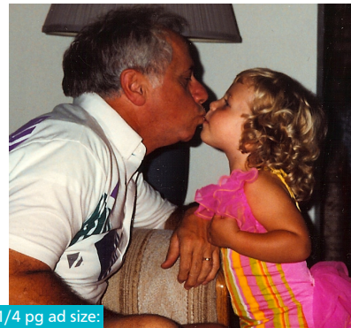
1/4 pg ad size: 5.25 in x 4 in